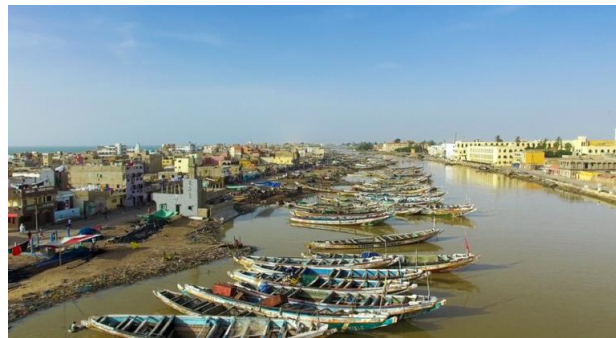
Addressing the climate change challenges in Saint-Louis, Senegal