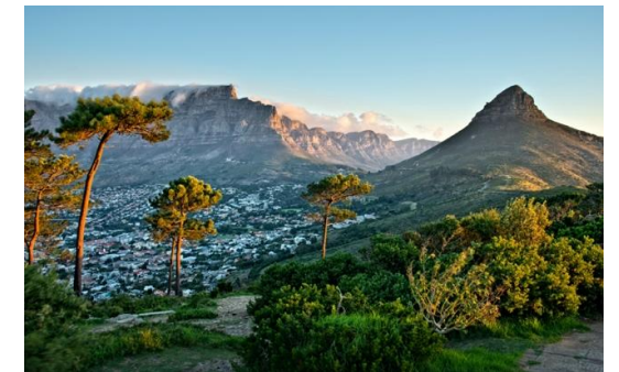
Analysis of Cape Town's climate-smart investments