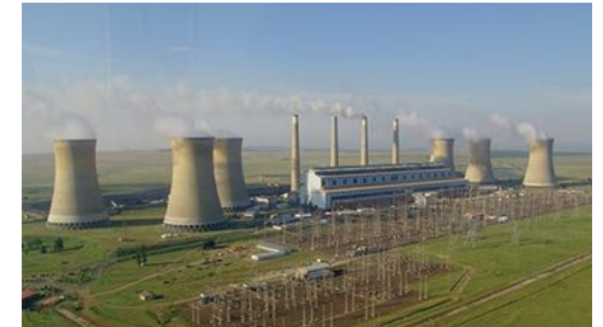
Green options for South Africa's ageing coal power stations