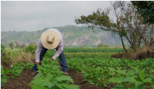
Strengthening NDCs for Climate Action

Through the NDC Partnership, CFE has provided technical support to +20 national governments across Africa, Asia, Latin America and the Caucasus in NDCs implementation planning and investment.