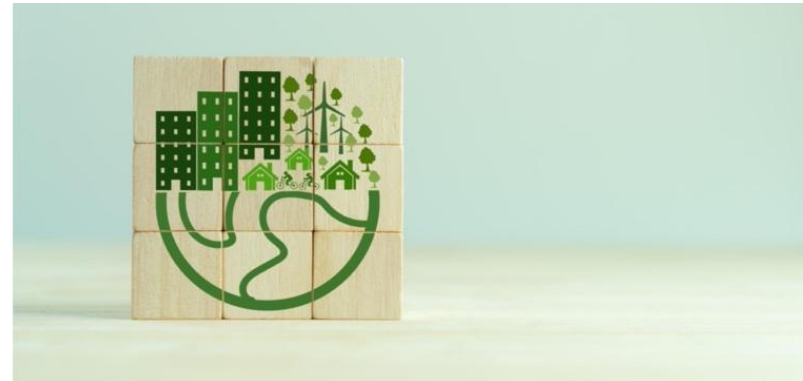
SA climate resilience: Crafting innovative adaptation financing mechanisms