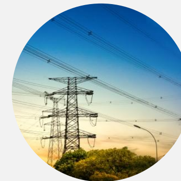
Energy & Minerals

Climate change mitigation will – and should – look different in Africa. LOW CARBON GROWTH is essential, but not as a global obligation. It's to avoid lock-in, buffer against uncertain fossil fuel markets, mitigate biomass loss, access carbon finance and foster competitive green industrialisation.