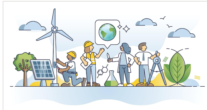
ILO guidelines for green employment diagnostics