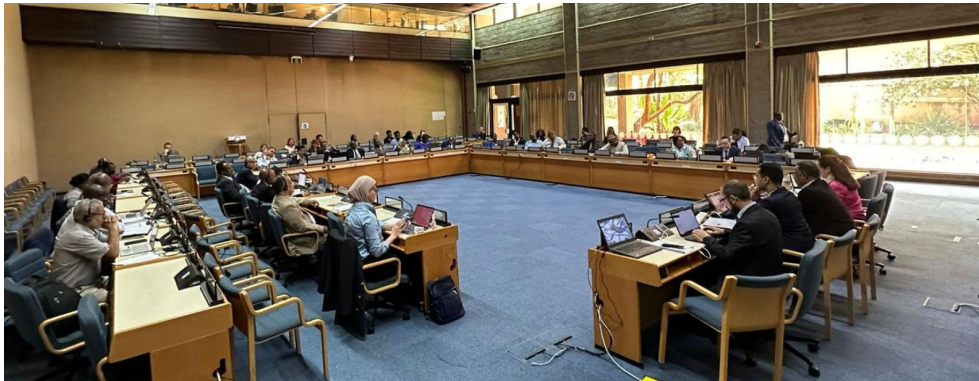
Refining comprehensive risk management in Sub-Saharan Africa

CFE was commissioned by the UN Disaster Risk Reduction (UNDRR) Regional Office for Africa to provide technical support to development of their comprehensive risk management approach , which informed planning across the continent. Included alignment to NDCs and NAPs, and help preparing for a COP27 side event.