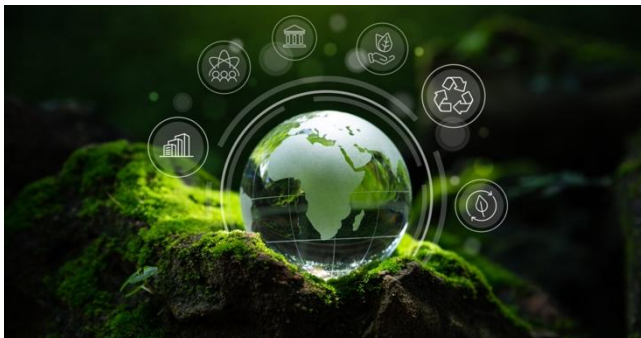
Advancing climate governance in emerging markets

With funding from the UK government, Genesis supported the Climate Finance Accelerator programme in Egypt. The CFA is a four-year technical assistance programme developing a pipeline of bankable, low-carbon projects and identifying suitable financing options.